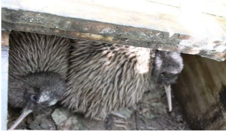
Kaipupu Point trip for Room 1